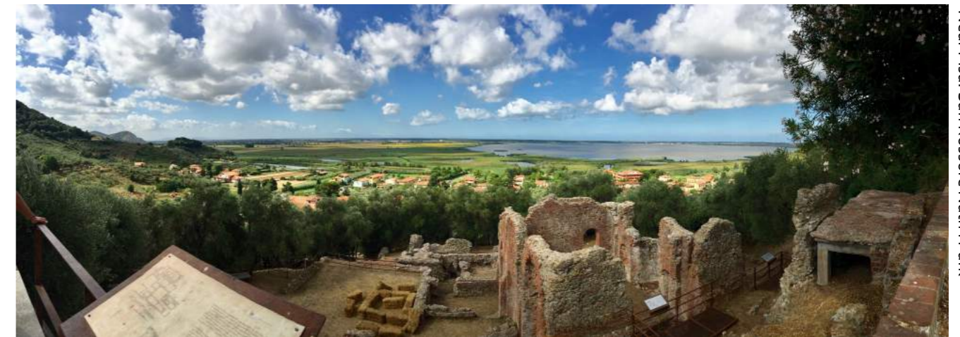
Near Pisa: San Rossore Natr'l Park

Summer School 2018 in France, Italy and the Netherlands Followed by an optional one-month work placement in France